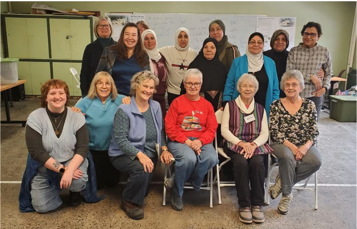
We finished up a session of our refugee sewing classes today. I will miss these fabulous students! Eight volunteer teachers and eight terrific students.

You are welcome to visit any time, Thursdays from 12:15 to 2:45, 501 Park Street. Call my phone and I will come up to unlock the door.